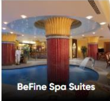
BeFine Spa Suites

Refresh and rejuvenate mind, body and spirit during your Antalya visit at BeFine Spa center. Located within the hotel, our tranquil and luxurious spa offers 7,500 square meters of serene space – designed by KLAFS My Sauna & Spa, the German-based, internationally renowned spa manufacturer. Indulge in a calming massage or body treatment. Complemented by saunas, steam rooms, Turkish baths and multiple relaxation areas, our resort spa offers a respite from the hustle and bustle of everyday life. Explore our wellness and detox packages, which can be used in combination with personalized fitness programs created by the gym's knowledgeable trainers.